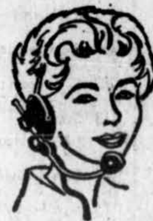
Your Telephone Operator

If you always hear a busy signal when calling a certain local number it may be that the number is on your party line. To find out if it is and how to complete your call dial 611. (Repair Service).